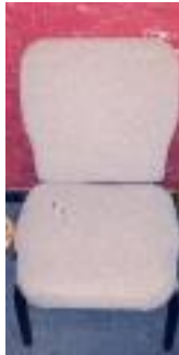
4 Gray Chairs