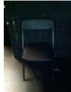
Black Folding Chairs