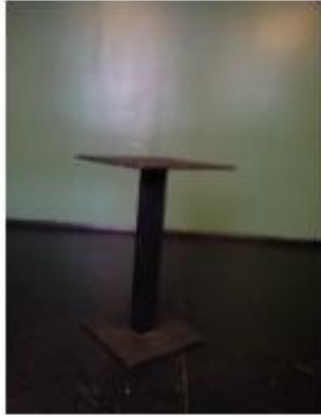
2 Black Cabaret Table