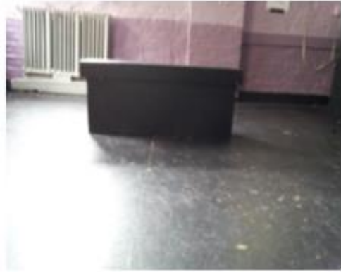
2 Black Bench