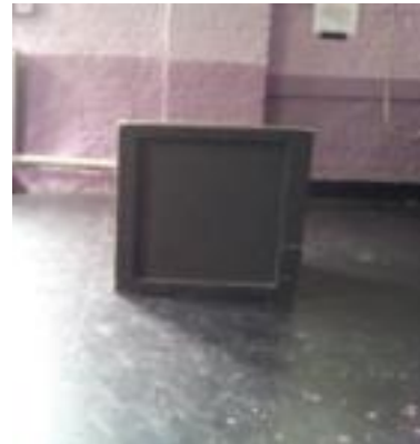
2 Black Acting Cubes