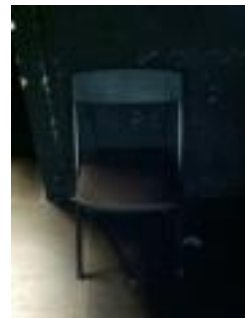
Black Folding Chairs